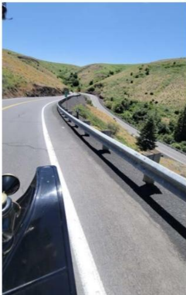
First day switchbacks