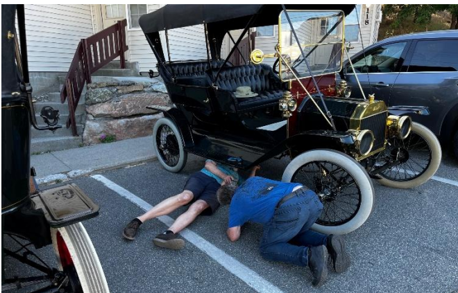
We weren't the only ones with car trouble.