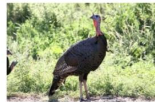
The Portland Gas Leak, Volume

Howard is already looking forward to 15/15 tour '24.