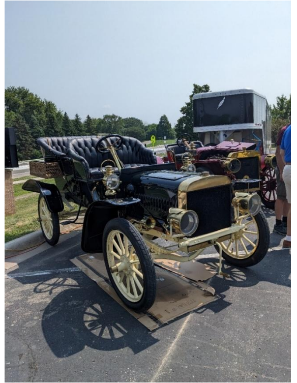
Model B Ford with a brand-new restoration!