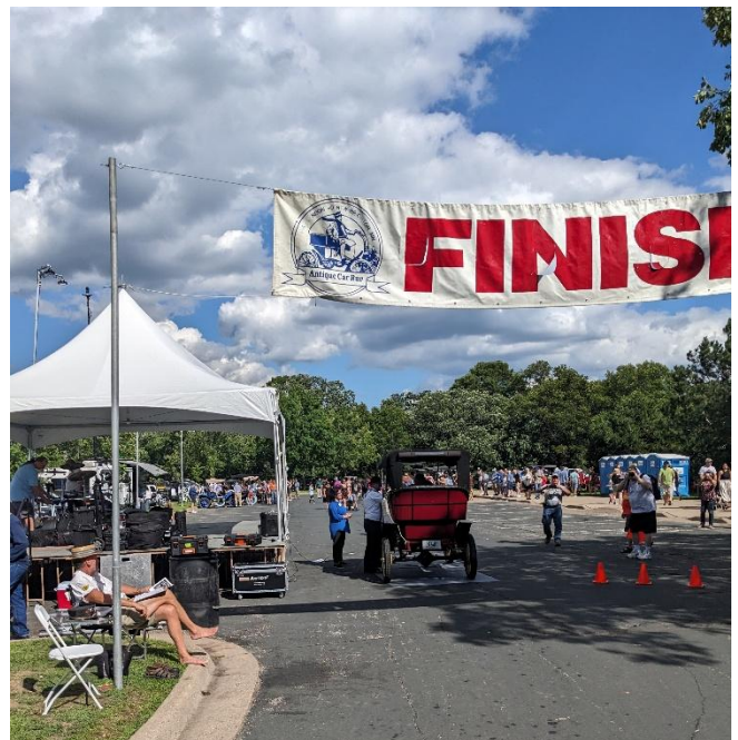
This is the finish line of the 120-mile car reliability car run. Both the mayors of New London & New Brighton are at the finish line to welcome all the cars and interview the drivers.