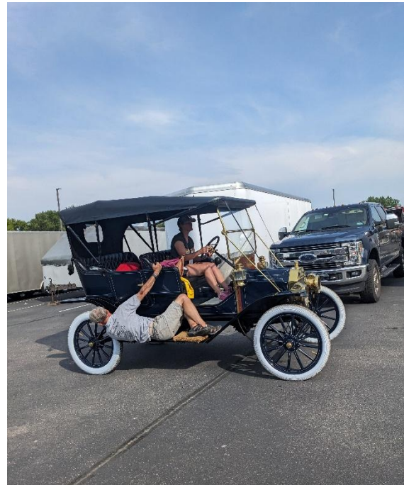
This guy rode around and around to remedy some problems on a car.