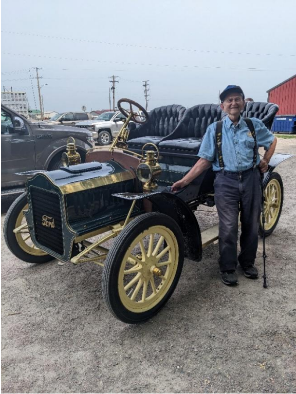
I got to ride in this 1906 2-cylinder 10hp model B Ford. Great ride!