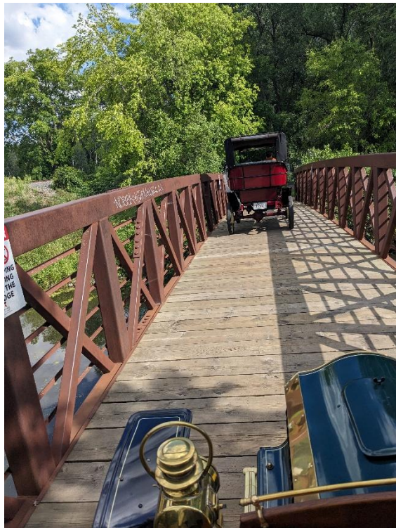
The very narrow walking wood bridge we pass over at the end.