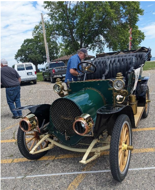
An air-cooled Franklin