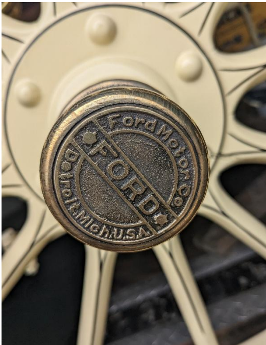
Three different hub caps on the early Fords.