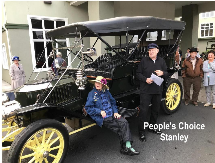
People's Choice Stanley