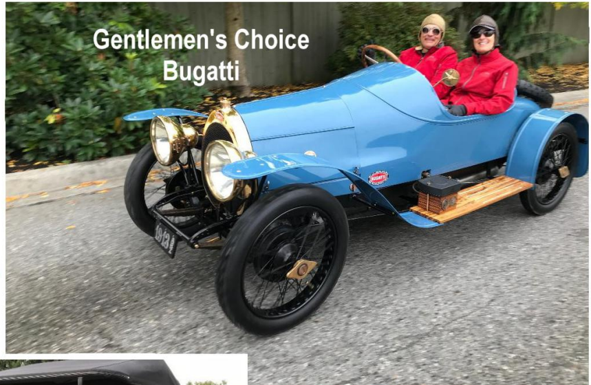
Gentlemen's Choice Bugatti

Our toys have gotten bigger, but they still SHAKE, RATTLE, & ROLL !