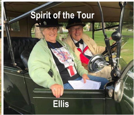
Spirit of the Tour