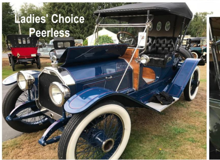
Ladies' Choice Peerless