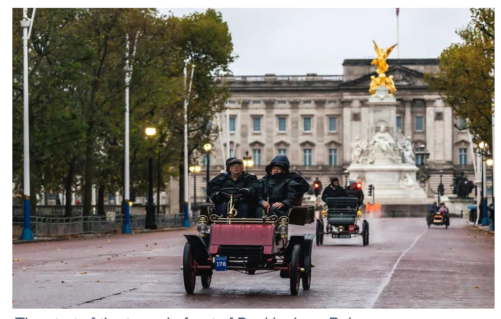
The start of the tour. In front of Buckingham Palace.

It worked out according to plan, and we went to line up in our sector to leave at 7:15 AM. There was a mini-traffic jam in the lineup as cars were going in all directions. Gradually all cars found their places. The slower ones lining up first and all the others by the numbers. We left Hyde Park on time, passed Buckingham Palace and started on our way to Brighton! Observers were all along the route cheering us on. We tried to thank all the car club helpers and wave to the spectators. There were a lot of them! Some had occupied the same viewing spot for years!