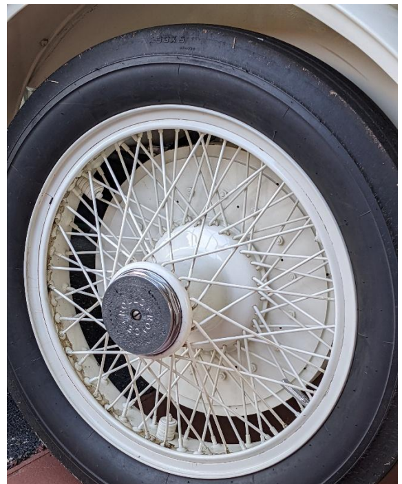
BIGGEST BRAKES EVER!