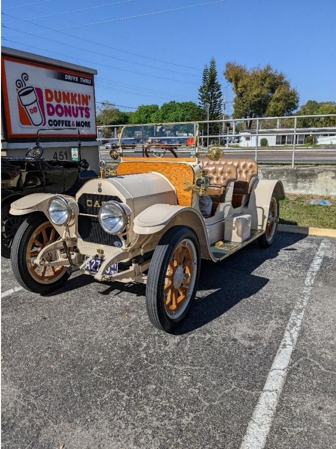
CASE TOURING. NO DOORS?