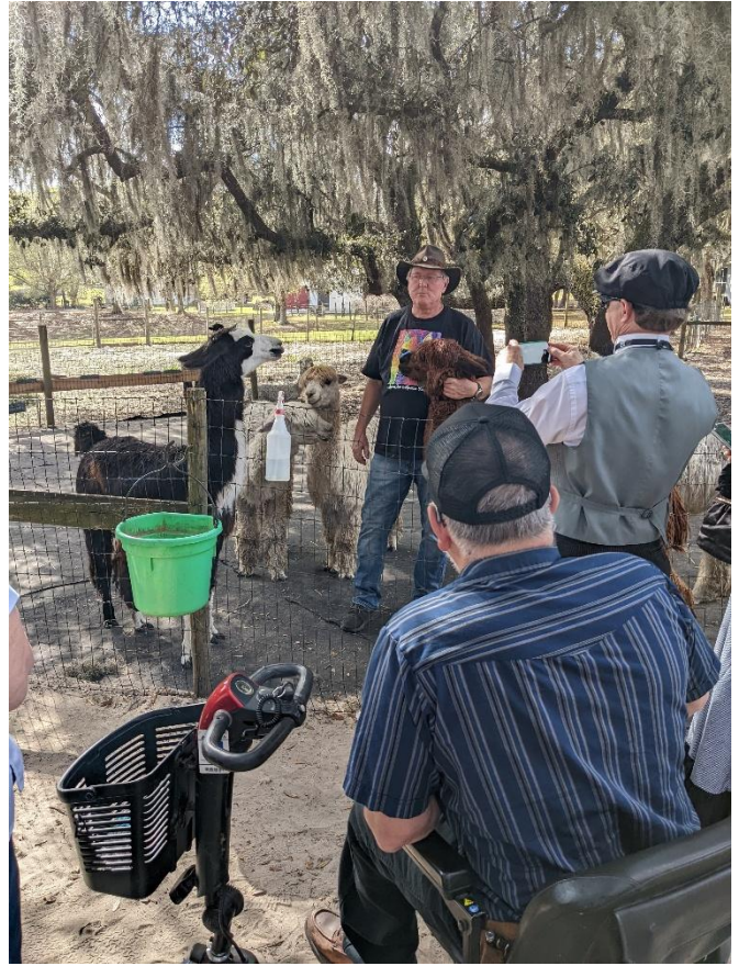
TOUR TO ALPACA/LLAMA FARM