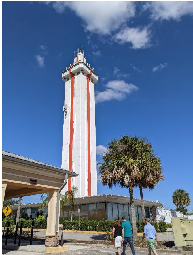
Photo is of Citrus Tower. The highest natural place in Florida, it is 354 Feet above Sea Level. This is a vantage point to see the surrounding area.