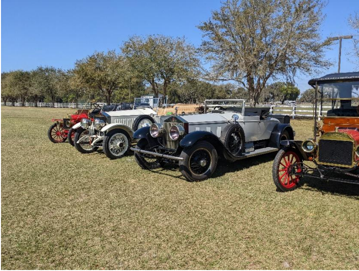
TWO ROLLS ROYCE CARS