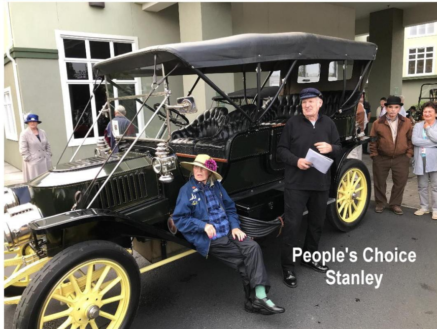
People's Choice Stanley