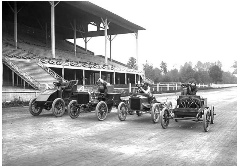
Left to right: White (Model E) Steamer w/ modified hood, 1905 Winton (Model C : 16-20Hp), 1905 Cadillac, 1905 Franklin Type E