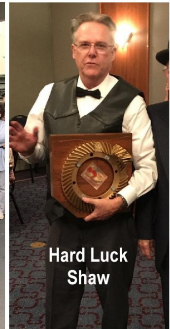
Hard Luck Shaw