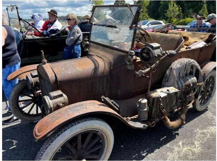
Schmidt's Model T with original everything