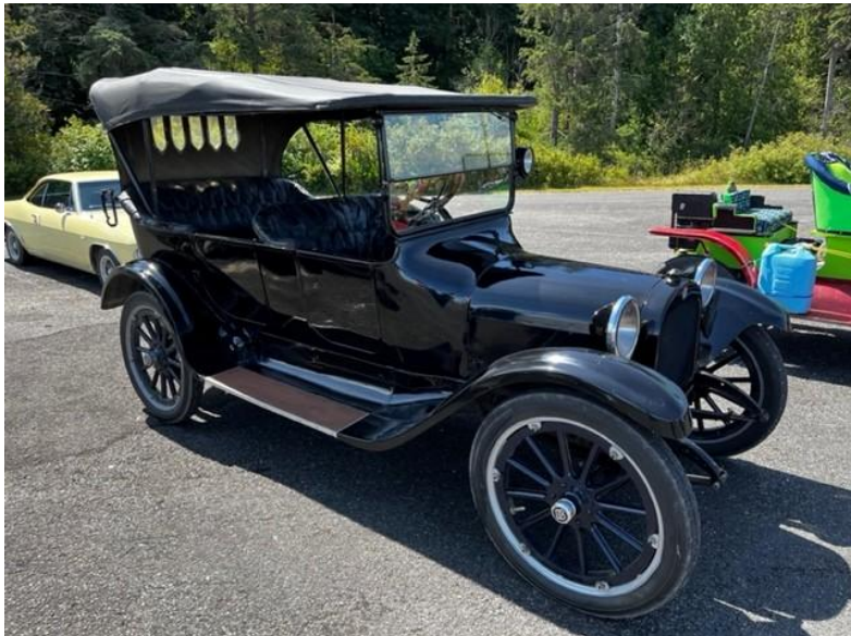
The Martins were joined by their daughter in their 1915 Dodge Touring Car