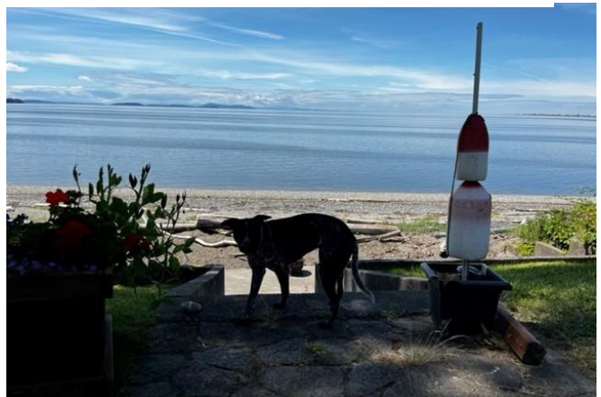
Bessie pointed out the beautiful view from the deck.